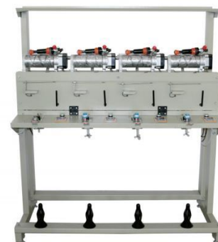
上油机 Winding machine with oiling

Application: It is used to waxing the yarn in hosiery mill and woolen mill. It can be used for computerized flat knitting machine and large diameter circular knitting machine.